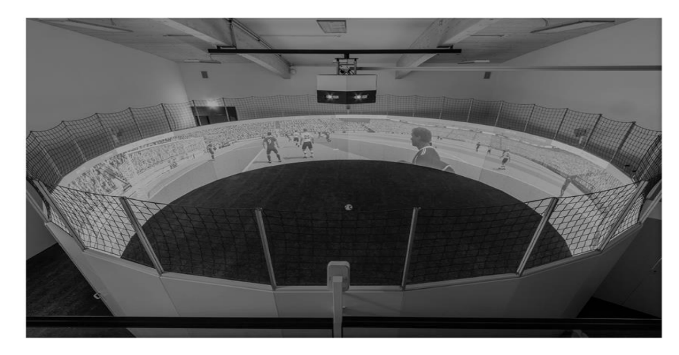
Fig. (3). 360° simulator. Available online under the Creative Commons Attribution-Non Commercial-NoDerivatives CC-BY-4.0 License [31].

From the interactive characteristics of simulation tools, of the 9 studies using HMDs, virtual reality headsets are HMDs combined with inertial measurement unit (IMU), so the tracking motion capture system is used for real-time feedback on user participation to achieve interaction. Of the 2 studies using CAVE, one of the studies used a tracking motion capture system [31] and another study interacted with the screen via a hand controller [32]. Of the 7 studies that used screen-based simulation, participants of four studies interacted directly with the screen via sensors (including mouse, tap on the screen, handheld response devices or gamepads) and participants of three interacted orally or in writing.