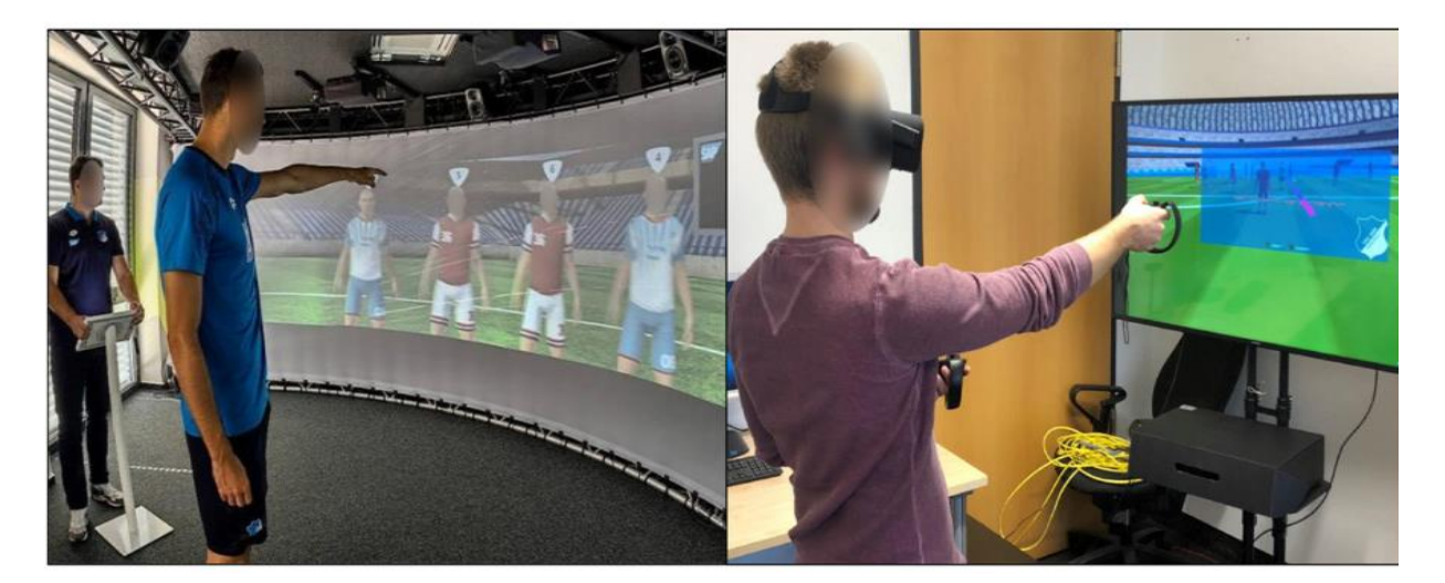
Fig. (2). VR training platform for football. Available online under the under the terms of the Creative Commons Attribution License (CC BY) [30].